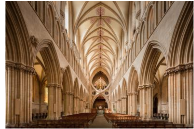
Table tennis on Mondays, Wednesdays and Fridays Craft Group Bridge Intermediate Just Sew Art for Pleasure French Intermediate and Advanced Church Visiting Group Pétanque Canasta on Wednesday. Beginners welcome