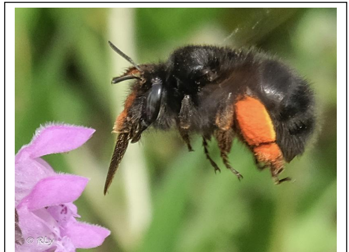
Female, tongue sheath extended, carrying bright-orange pollen from Red Dead-nettle

In fact, females are often mistaken for small bumble bees. Completely black with orange hairs on her rear leg, though this pollen-carrying 'scopa' is more often seen as the colour of its load.