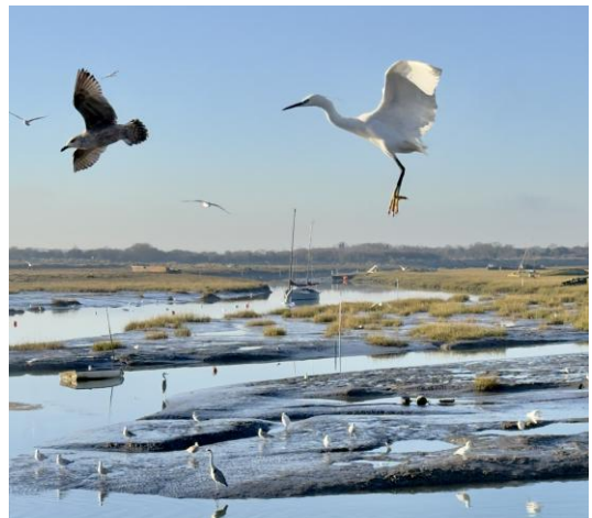
Leigh high low birds everywhere by Alan Lyall